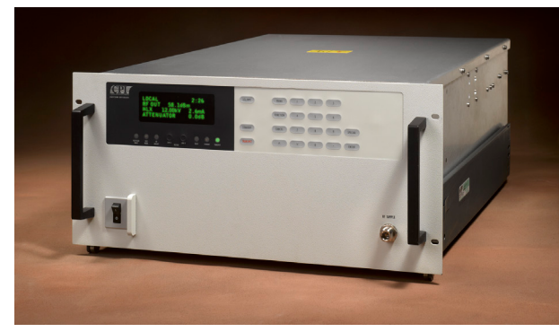
CPI 250/320 W S/C-band TWTA, Model VZSC6963J2

Backed by over 40 years of satellite communications experience, and CPI's worldwide 24-hour customer support network that includes more than 20 regional factory service centers.