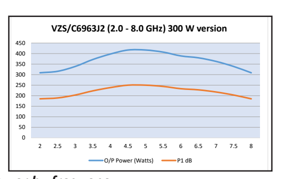
Typical output power by frequency